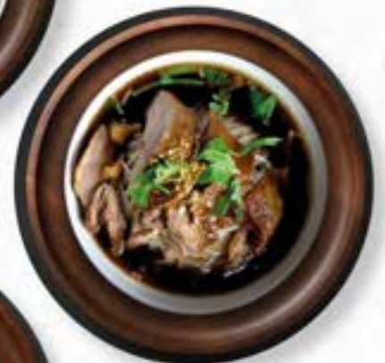
DUCK NOODLE SOUP