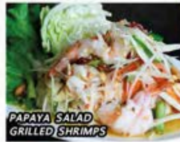
PAPAYA SALAD GRILLED SHRIMPS

เนื้อย่าง Grilled sliced beef mixed in lime-based dressing with rice powder, chili powder, cilantro, shallot, fresh basil leaves