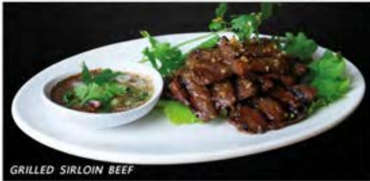
GRILLED SIRLOIN BEEF