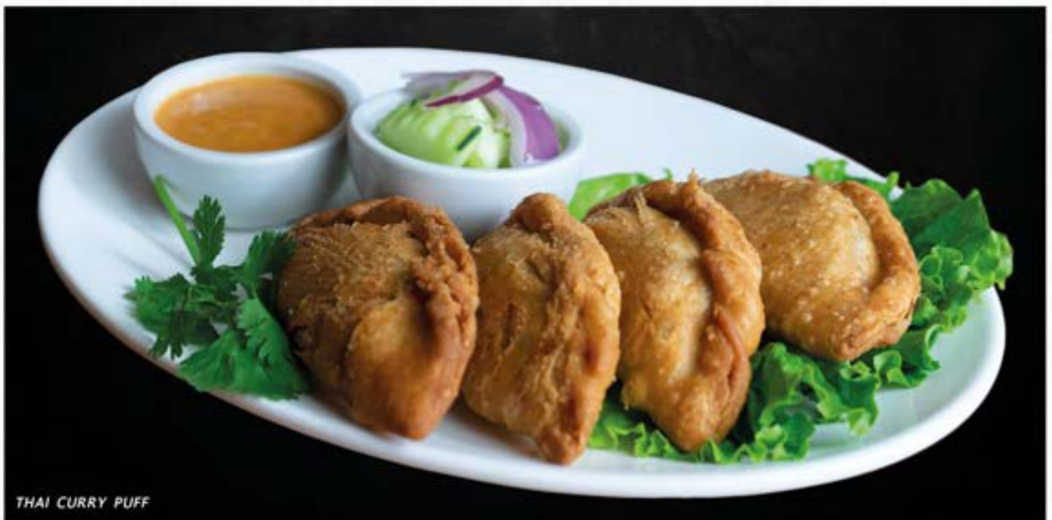
THAI CURRY PUFF