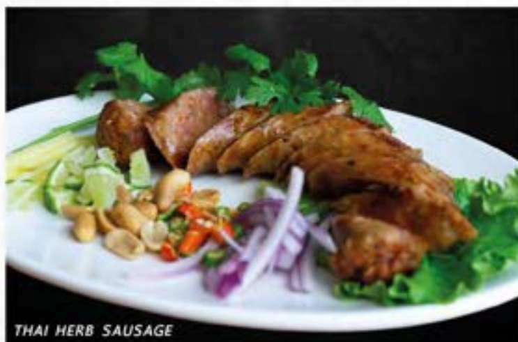
THAI HERB SAUSAGE