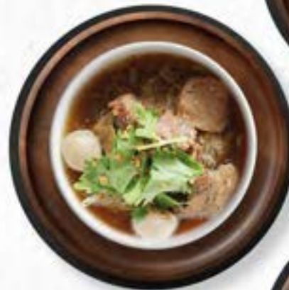
BEEF AND MEATBALL NOODLE SOUP