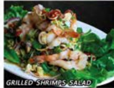
GRILLED SHRIMPS SALAD