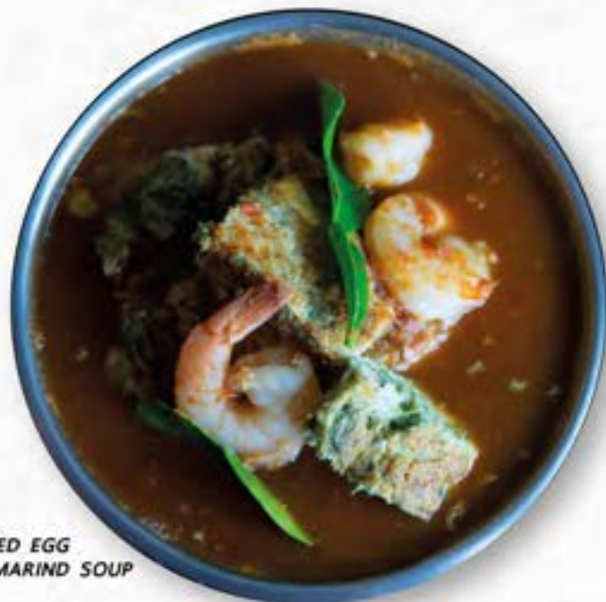
FRIED EGG TAMARIND SOUP