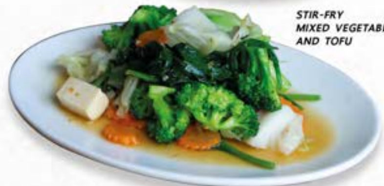
STIR-FRY MIXED VEGETABLE AND TOFU

SPICY TOFU 15.95 กะเพราเต้าหู้ Tofu stir-fried with garlic, Thai fresh chili, basil leaves, carrot, bamboo shoot, and red bell peppers in Thai traditional way