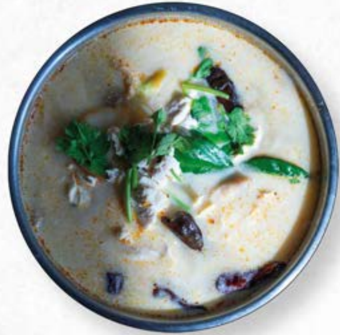
THAI COCONUT SOUP