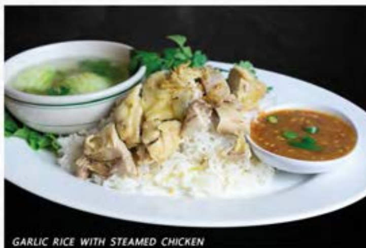
GARLIC RICE WITH STEAMED CHICKEN