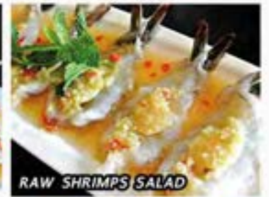
RAW SHRIMPS SALAD