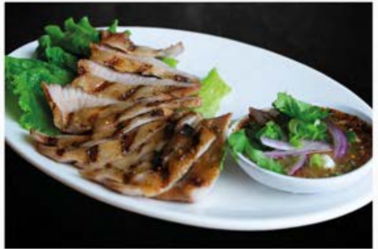
GRILLED PORK SHOULDER "KOH MOO YANG"