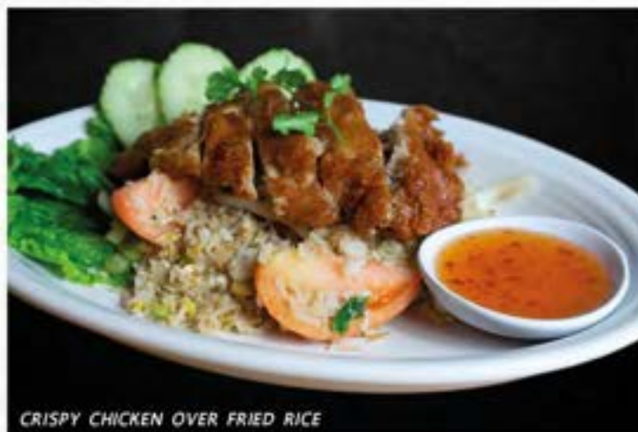
CRISPY CHICKEN OVER FRIED RICE