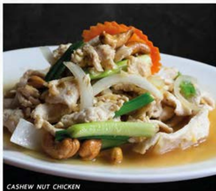
CASHEW NUT CHICKEN