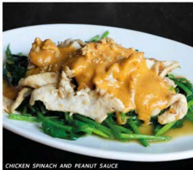
CHICKEN SPINACH AND PEANUT SAUCE