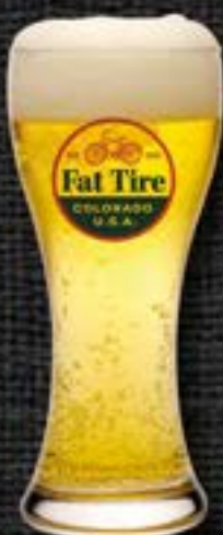
FAT TIRE 6.50