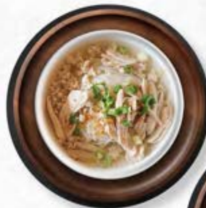
CHICKEN NOODLE SOUP