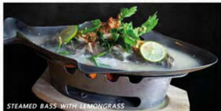
STEAMED BASS WITH LEMONGRASS

Medium spicy green curry with fish cake, Thai eggplant, bamboo shoot, red bell peppers, kaffir lime leaves.