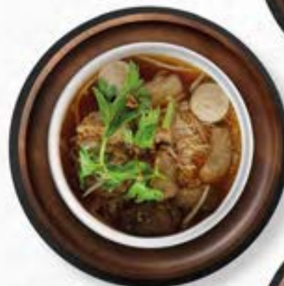
BEEF TENDON NOODLE SOUP