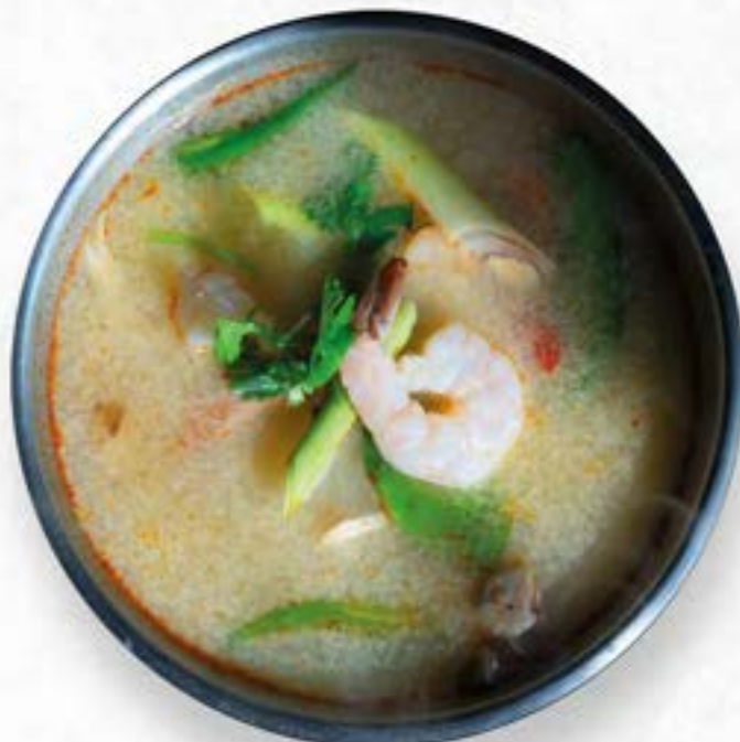
HOT AND SOUR THAI TOM YUM SOUP