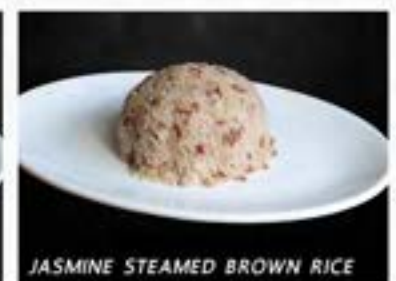
JASMINE STEAMED BROWN RICE