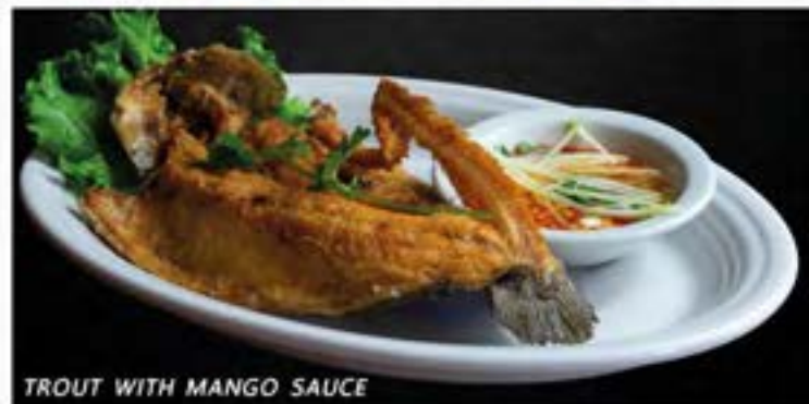
TROUT WITH MANGO SAUCE