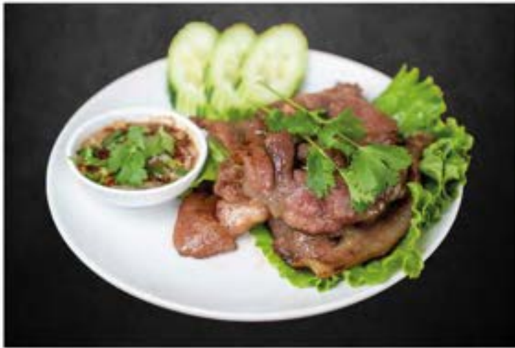
THAI GRILLED PORK