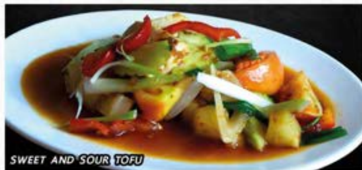
SWEET AND SOUR TOFU

EGGPLANT TOFU 15.95 เต้าหู้พัดมะเขือ Stir-fried eggplant, tofu, red bell peppers, with garlic chili sauce and basil