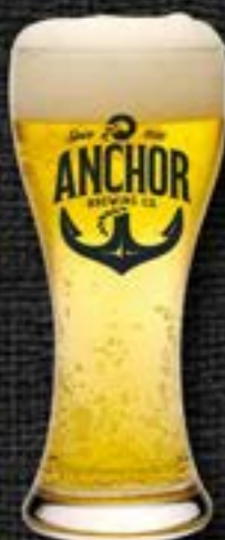
ANCHOR STEAM 6.50