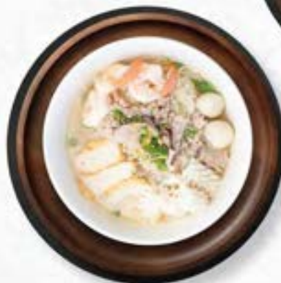
COMBINATION NOODLE SOUP