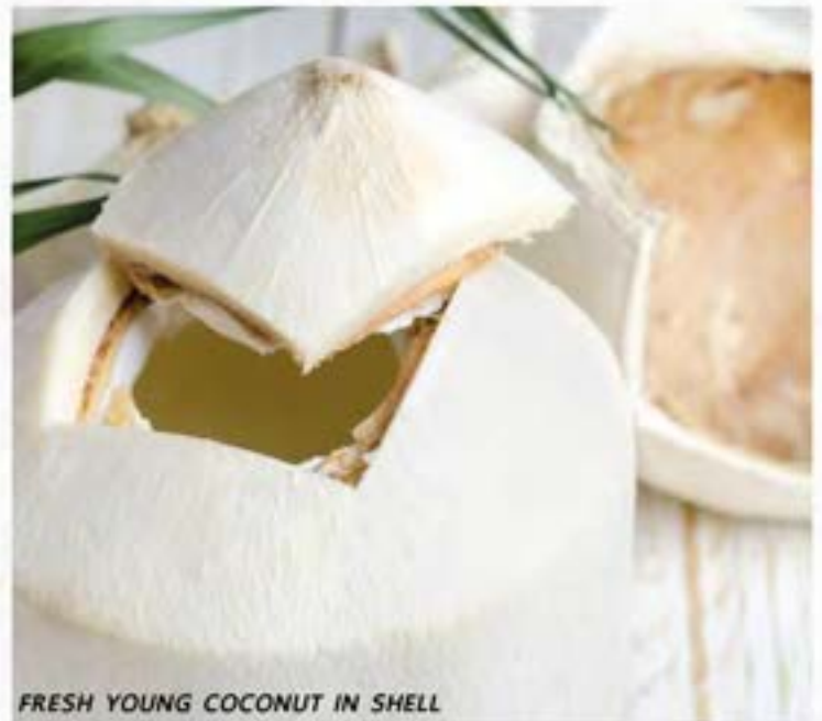
FRESH YOUNG COCONUT IN SHELL