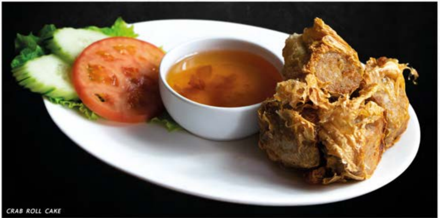
CRAB ROLL CAKE