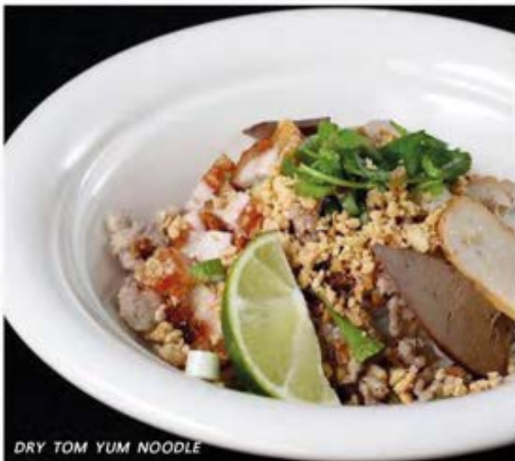
DRY TOM YUM NOODLE