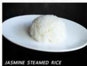
JASMINE STEAMED RICE