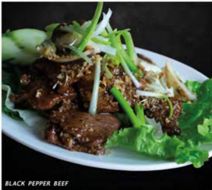
BLACK PEPPER BEEF