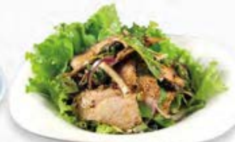
GRILLED PORK SHOULDER SALAD