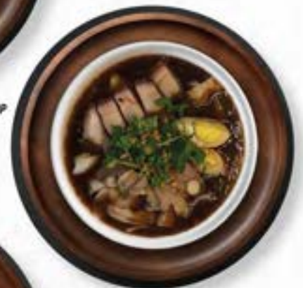
SQUARE RICE NOODLE SOUP - KUAY JUB