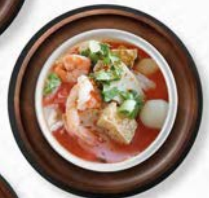
YEN TO FO NOODLE SOUP