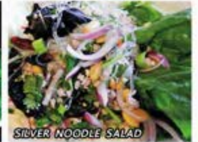
SILVER NOODLE SALAD