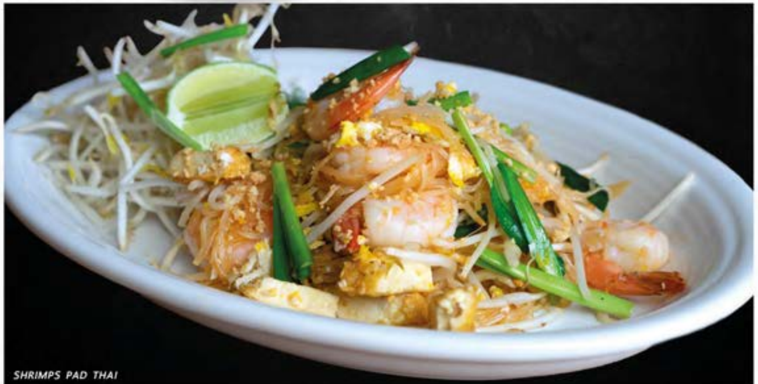
SHRIMPS PAD THAI

Silver noodles stir-fried with shrimps, egg and napa cabbage, carrot, and tomatoes