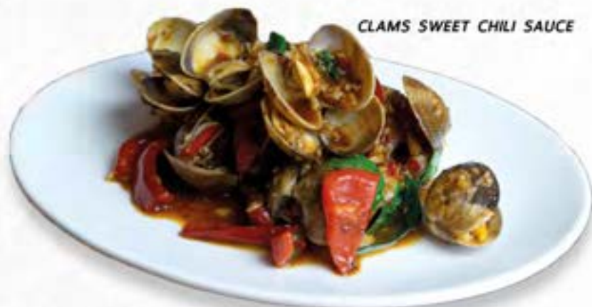
CLAMS SWEET CHILI SAUCE