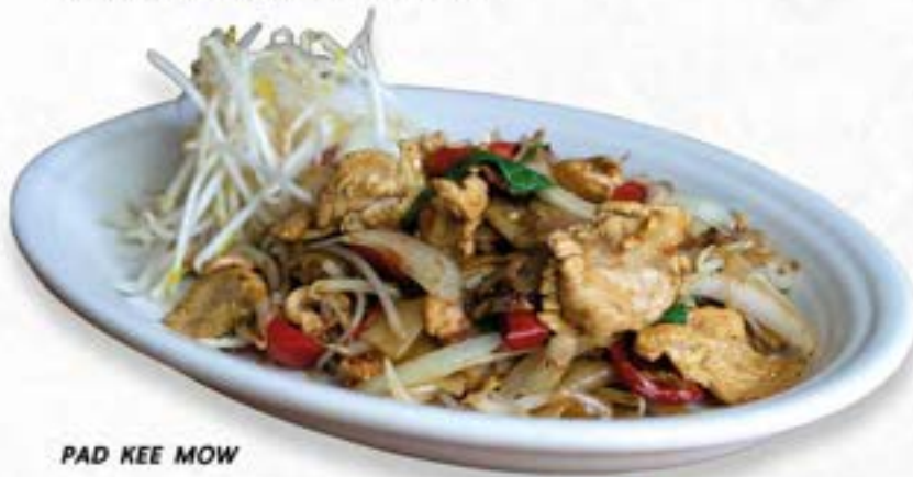
PAD KEE MOW