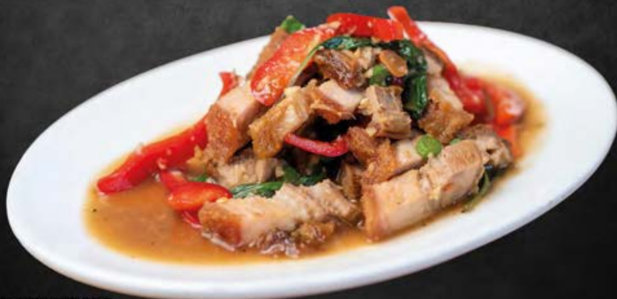
CRISPY PORK BELLY WITH BASIL