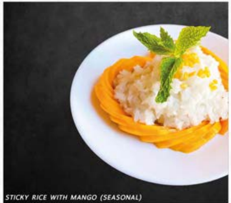
STICKY RICE WITH MANGO (SEASONAL)

* CHOICE OF VANILLA, STRAWBERRY, TOASTED ALMOND, WHITE PISTACHIO, COFFEE