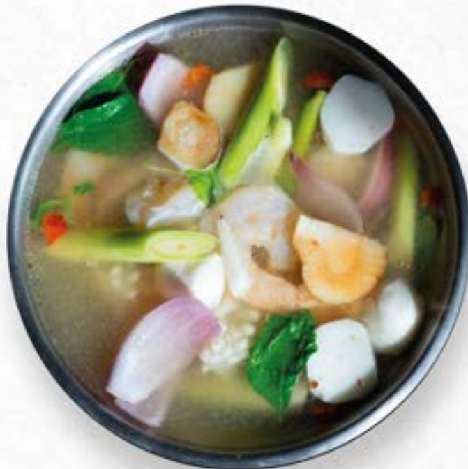
SEAFOOD POH - TAK SOUP