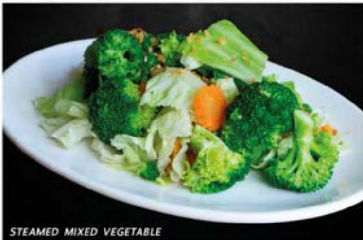
STEAMED MIXED VEGETABLE