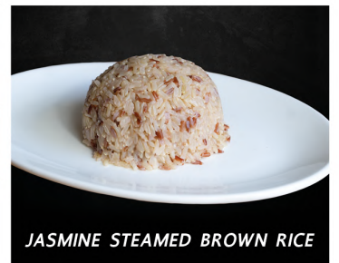
JASMINE STEAMED BROWN RICE