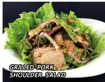
GRILLED PORK SHOULDER SALAD