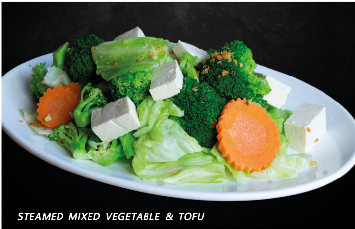
STEAMED MIXED VEGETABLE & TOFU