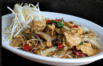
PAD KEE MOW

Silver noodles stir-fried with Shrimps, egg and napa cabbage and tomatoes