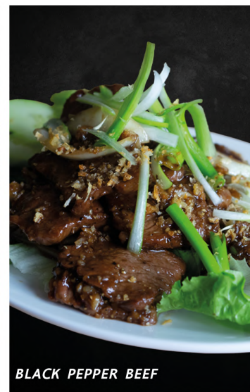
BLACK PEPPER BEEF