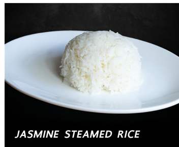
JASMINE STEAMED RICE