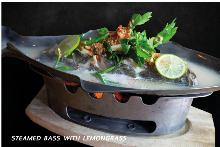
STEAMED BASS WITH LEMONGRASS