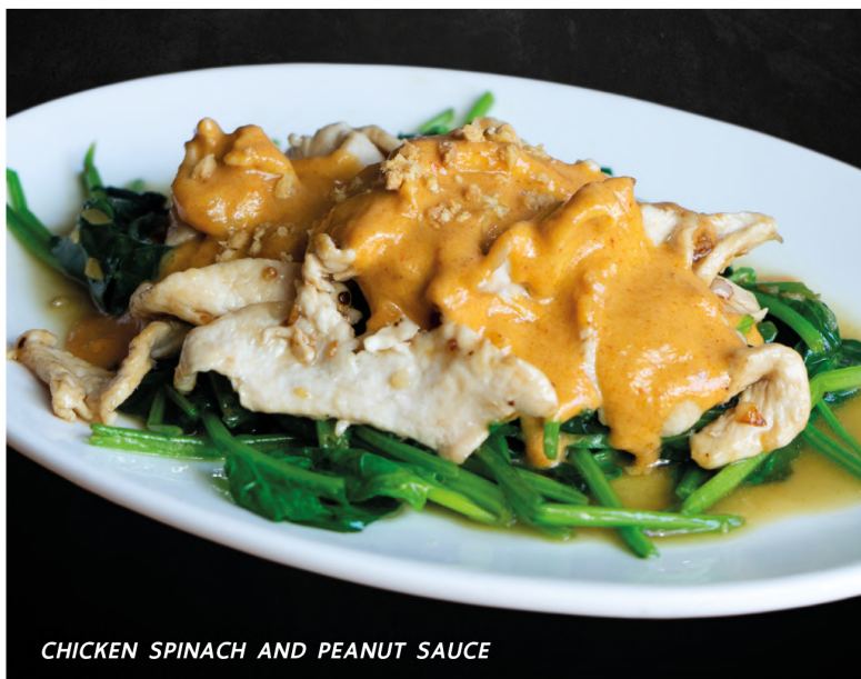
CHICKEN SPINACH AND PEANUT SAUCE

Five spices duck, de-boned and served on a bed of Chinese broccoli with garlic. Served with vinegar and chili blended sauce