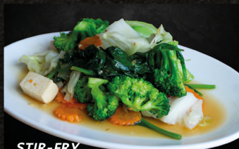
STIR-FRY MIXED VEGETABLE AND TOFU

Fresh mixed greens, tomato, cucumber and topping by fried tofu and peanut salad dressing