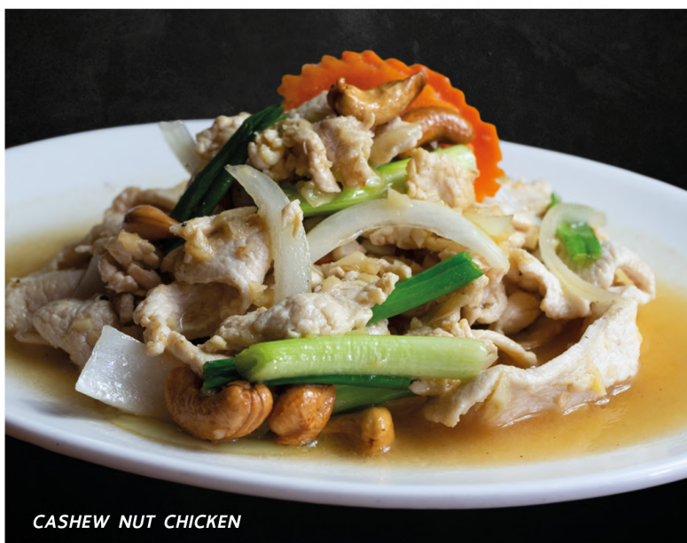
CASHEW NUT CHICKEN