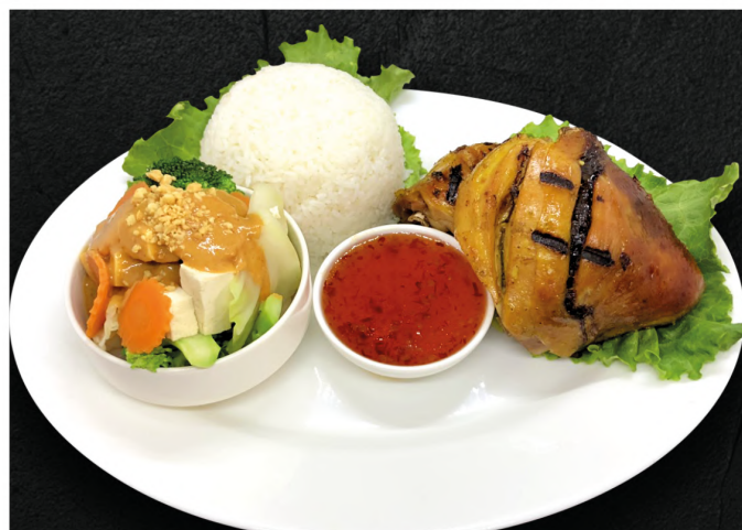
J : BBQ CHICKEN & Q: TOFU IN PEANUT SAUCE

Take out from this menu page is AVAILABLE for specific day and time. Please check with restaurant.