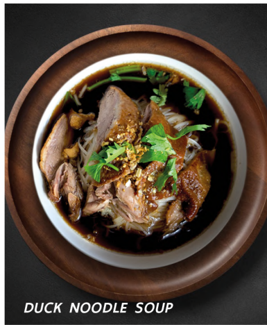
DUCK NOODLE SOUP