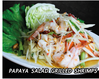
PAPAYA SALAD GRILLED SHRIMPS

Grilled sliced pork mixed in lime-based dressing with rice powder, chili powder, cilantro, shallot, fresh basil leaves