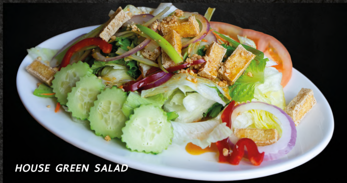
HOUSE GREEN SALAD