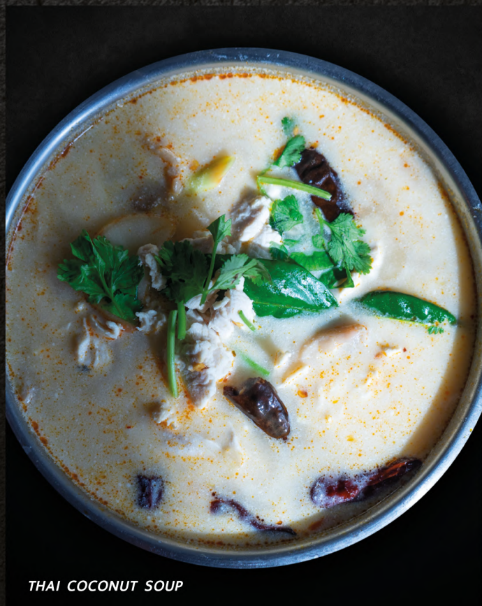
THAI COCONUT SOUP

Stuffed calamari with pork in house special clear broth, vegetable, black mushroom, and egg tofu