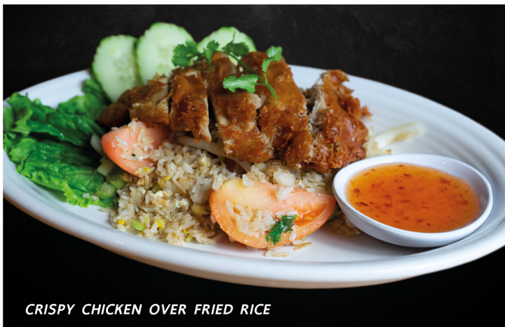
CRISPY CHICKEN OVER FRIED RICE