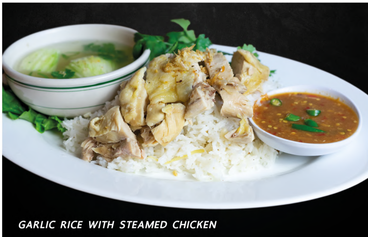
GARLIC RICE WITH STEAMED CHICKEN