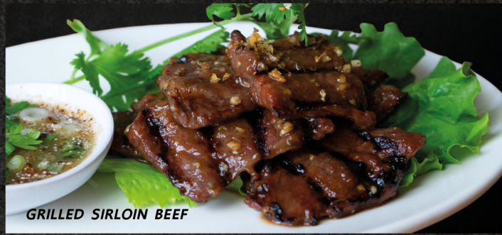
GRILLED SIRLOIN BEEF