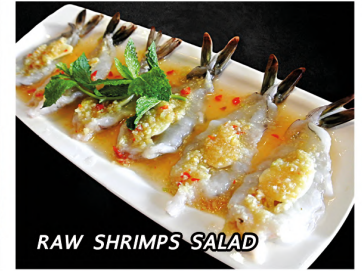
RAW SHRIMPS SALAD