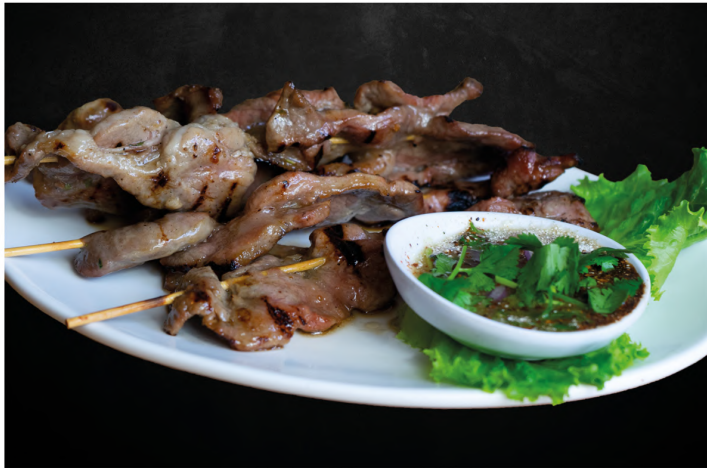
Grilled Pork Skewers