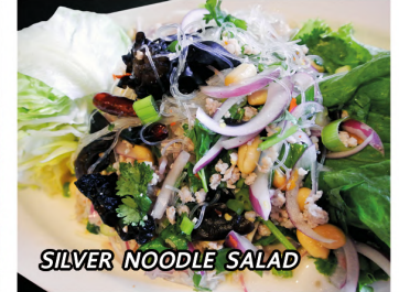
SILVER NOODLE SALAD