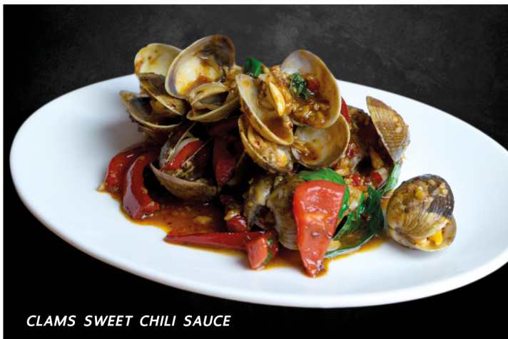
CLAMS SWEET CHILI SAUCE

Whole fried Tilapia with house chili based sauce. Whole fish; Bone in.