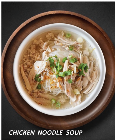
CHICKEN NOODLE SOUP

A Combination Noodle soup with sliced pork, ground pork, sliced fish cake, fish ball, calamari, shrimps, and rice noodle