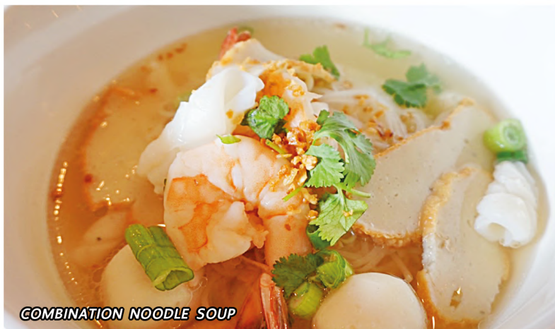
COMBINATION NOODLE SOUP