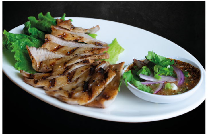
Grilled Pork Shoulder "Koh Moo Yang"