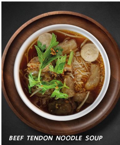
BEEF TENDON NOODLE SOUP