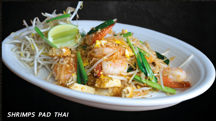
SHRIMPS PAD THAI