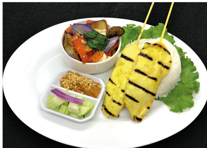
A : CHICKEN SATAY & N: EGGPLANT TOFU

Mixed vegetables and tofu topped with peanut sauce