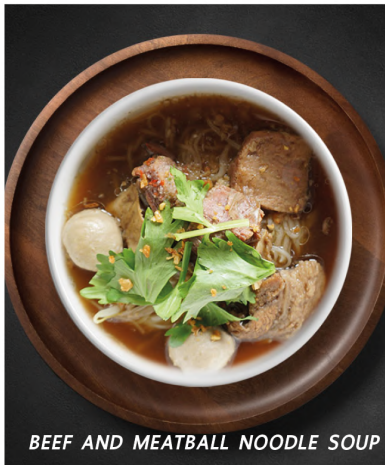
BEEF AND MEATBALL NOODLE SOUP