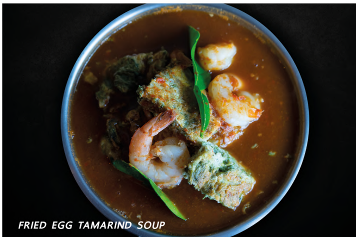
FRIED EGG TAMARIND SOUP