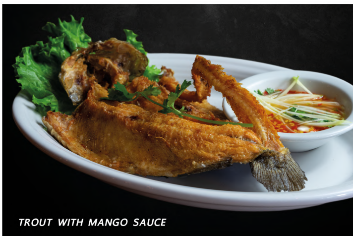
TROUT WITH MANGO SAUCE