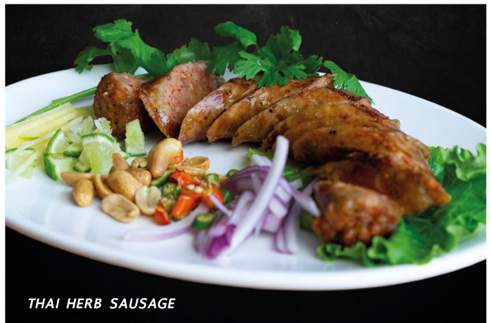
THAI HERB SAUSAGE