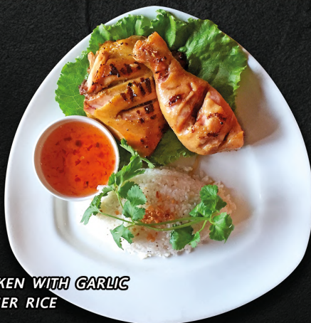
BBQ CHICKEN WITH GARLIC AND GINGER RICE