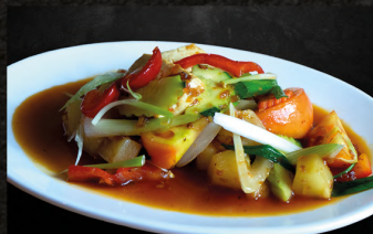
SWEET AND SOUR TOFU