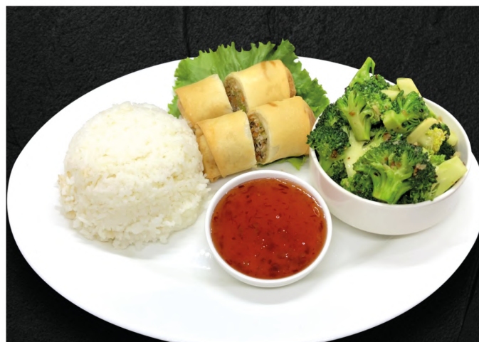
C : FRIED ROLL & O: STIR-FRY BROCCOLI