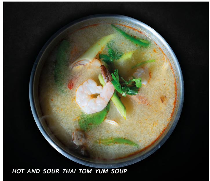
HOT AND SOUR THAI TOM YUM SOUP