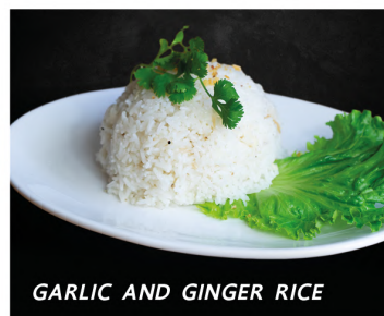
GARLIC AND GINGER RICE