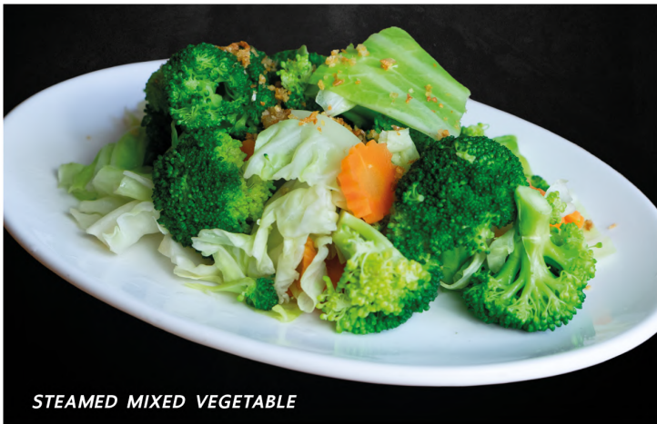
STEAMED MIXED VEGETABLE