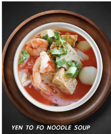
YEN TO FO NOODLE SOUP