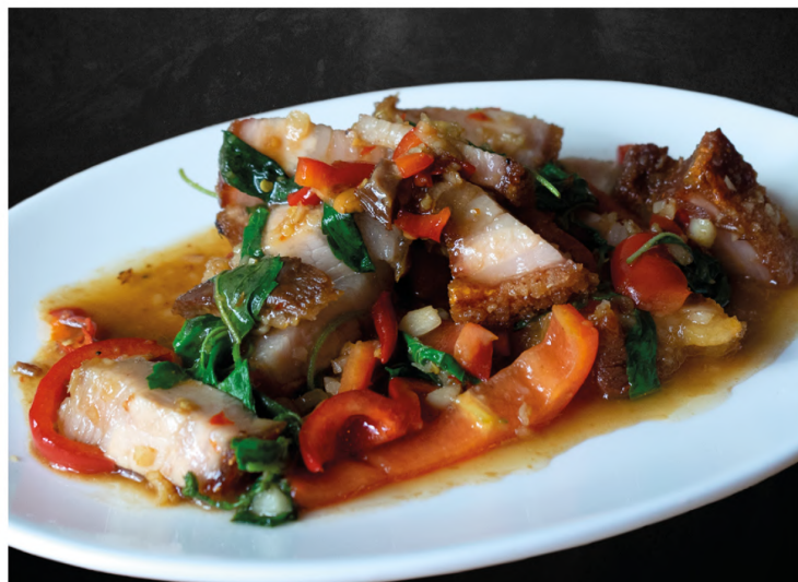
CRISPY PORK BELLY WITH BASIL