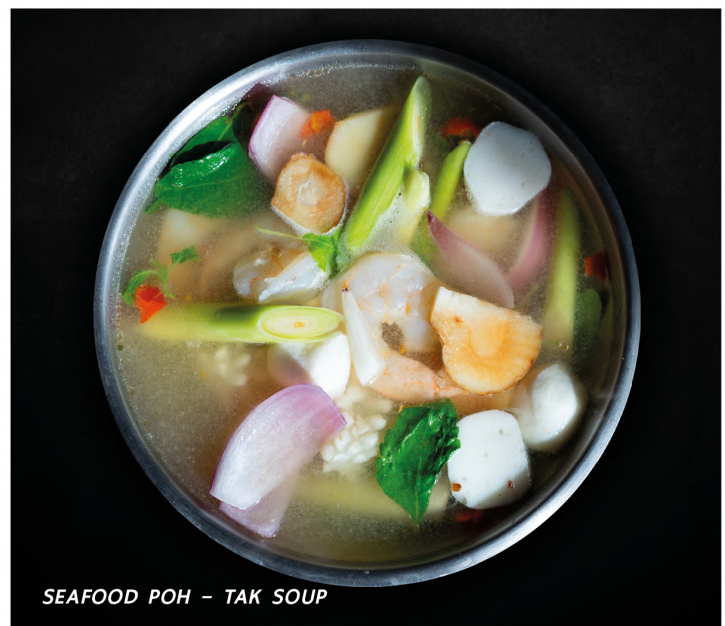
SEAFOOD POH – TAK SOUP