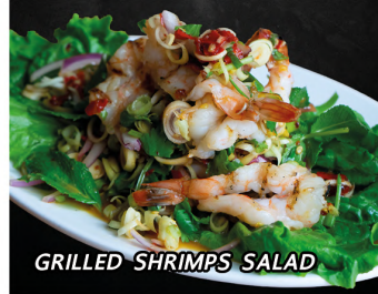
GRILLED SHRIMPS SALAD